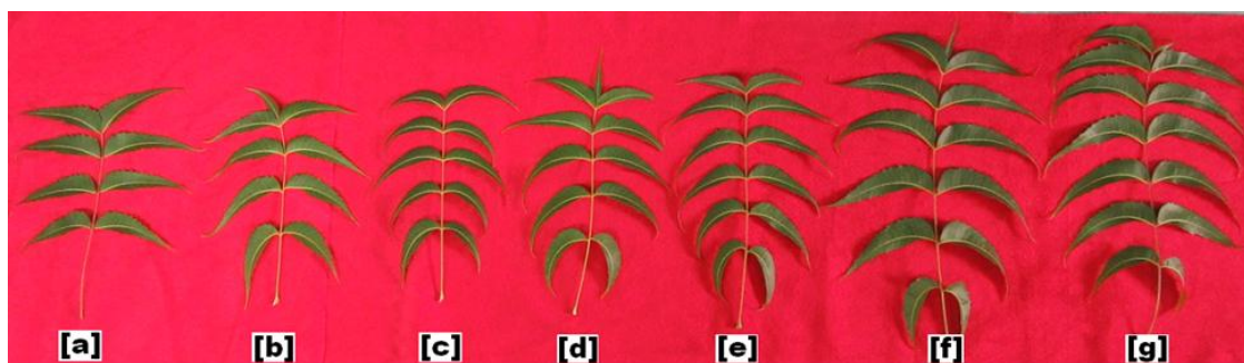
Figure 1: Leaves of A. indica showing variations in number of leaflets.

Two intermediate peaks: F_J (chlorophyll fluorescence at 2 ms.) and F_I (chlorophyll fluorescence at 30 ms) were observed between F_0 and F_m forming a typical O-J-I-P curve (Fig. 2 a, b). All leaflets showed same value of initial fluorescence ( F_0 ). Similar value of F_0 shows that light harvesting complexes in each leaflet are associated with reaction centers. On the other hand, a significant variation in F_m was observed between all leaflets. Higher F_m was observed in fully developed old leaflets. The decreased level of F_m in young leaflets indicates the presence of inactivated oxygen evolving complex (Yamashita and Butler, 1968; Schreiber and Neubauer, 1987).