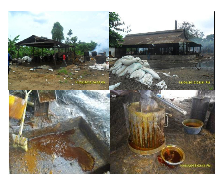
Figure 2: Palm oil processing environment in Nigeria