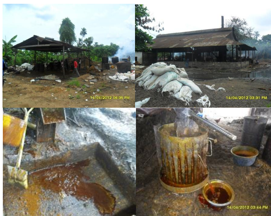
Figure 2: Palm oil processing environment in Nigeria